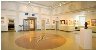
The Great Hall Gallery